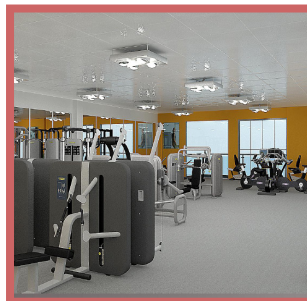
Pool (top) and artist's impression of Fitness Studio

The new £8m Dorchester Sports Centre is now open and has some great offers for students. The school and local community now have a fantastic 50-station fitness studio, dance studio, a six lane 25-metre swimming pool and a teaching pool.